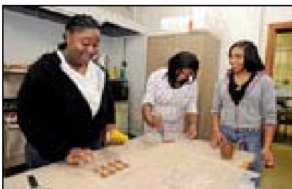
ANGEL Treats Duquesne, PA