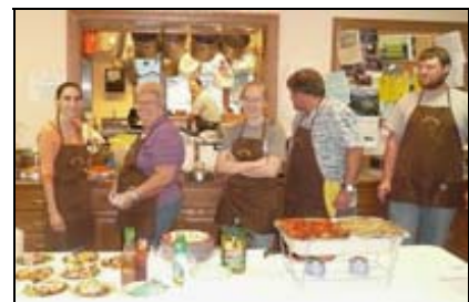
Holy Smokes! Fellowship Café Cheswick, PA