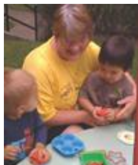
A Second Cup Pittsburgh, PA