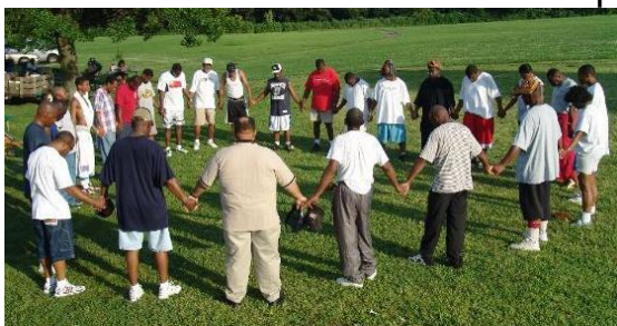
The Alumni Group Wallingford, PA