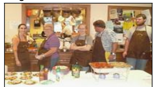
Holy Smokes! Fellowship Café Cheswick, PA