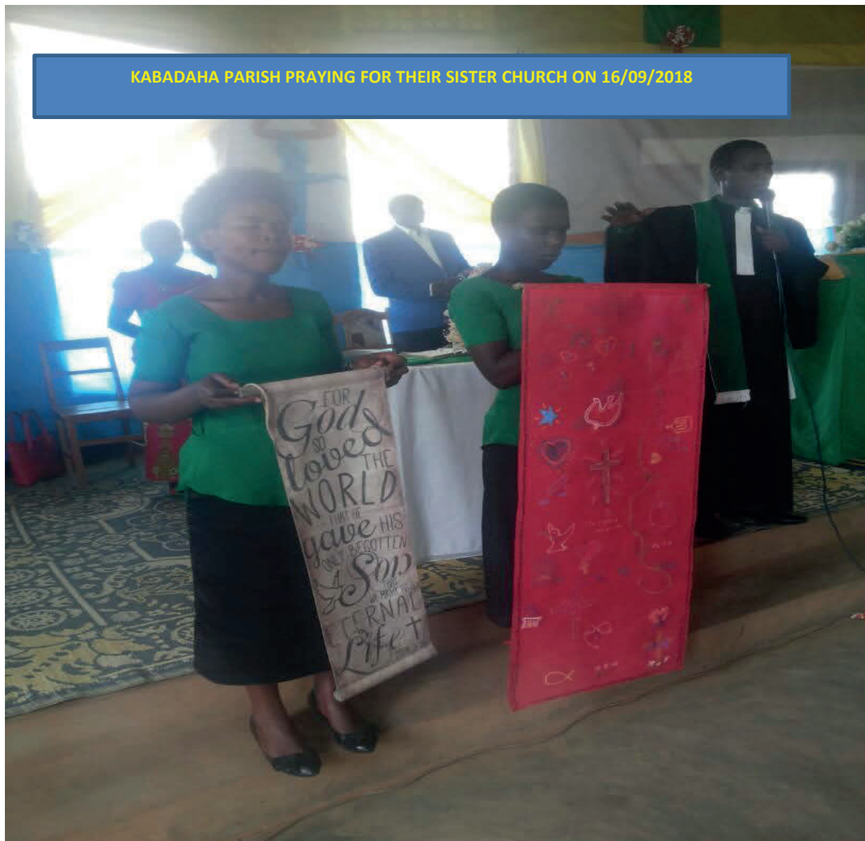
KABADAHA PARISH PRAYING FOR THEIR SISTER CHURCH ON 16/09/2018